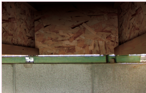
Caulk (Above: A gap is visible between the band joist and foundation.)