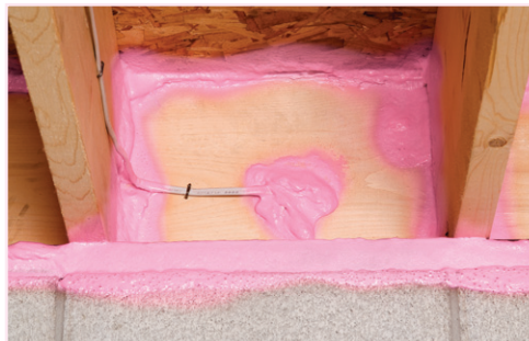
EnergyComplete™ Spray Foam