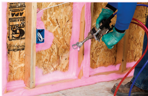
EnergyComplete™ Spray Foam