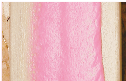
EnergyComplete™ Spray Foam