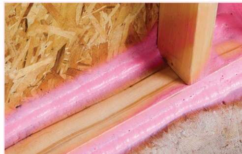
EnergyComplete™ Spray Foam