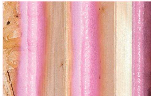
EnergyComplete™ Spray Foam